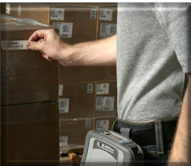
Wearing wireless mobile printers, workers can create, print and apply labels where needed.

“With over 28,000 inventory items in our database, the Wireless Handheld Solution is an excellent tool for managing our entire warehouse operation. It is simple to use, easy to read and provides the information we need – where we need it. In our fast moving environment, Physical Inventory Cycle Counting has been a burden but with the handheld it is much faster and more accurate. We can bring our handhelds to customer sites and quickly create quotes on location. Receiving labels are customized to print the information we need and can be generated from portable printers while items are still on the pallet – eliminating back-and-forth to stationary printers or handwritten information. The ability to change bins and relocate items allows us to place inventory strategically. Picking accuracy has increased dramatically due to audible beeps when the wrong item is selected. All in all, we have seen a rapid return on our investment by doing more with fewer people.”