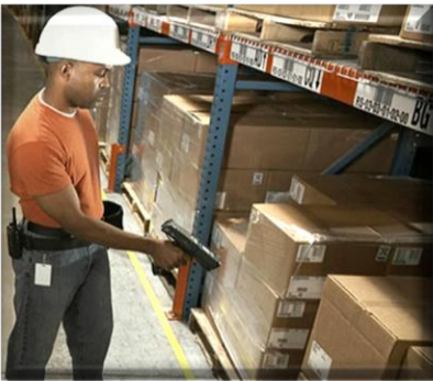
Wireless pick verification is much faster and more accurate by eliminating manual errors.

The Wireless Handheld Solution allows you to get an accurate picture of your inventory. The physical counts and cycle counting functions can dramatically improve operations by identifying misplaced and lost product. Eliminate trips to the warehouse to research “if the product is really there” by knowing exactly how much product is available and where it is located. Using inventory counts created in Acclamare, bar coded count sheets are created by bin locations, product group, vendor or item range. Bar coded count sheets can be printed by count number or as a master count list spanning multiple counts. Locations can be changed during the count and notes taken. Reports include: count variance, items not counted, notes taken and change bins.